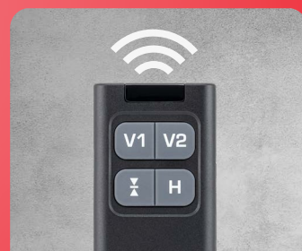
Remote control for quick and convenient adjustments