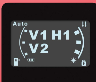
Digital information screen showing active functions