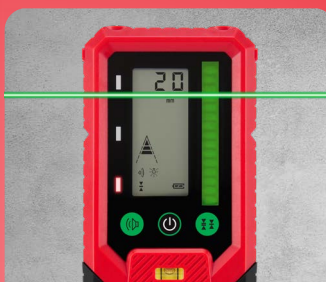
Millimetre detector for quick and easy adjustments with digital millimetre readout